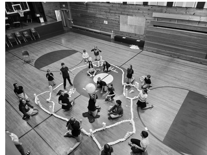
Middle School team building activity.

Our Mission: Serving as disciples, nourished by Christ, growing in faith, values, and overall excellence. We are Holy Family Catholic School