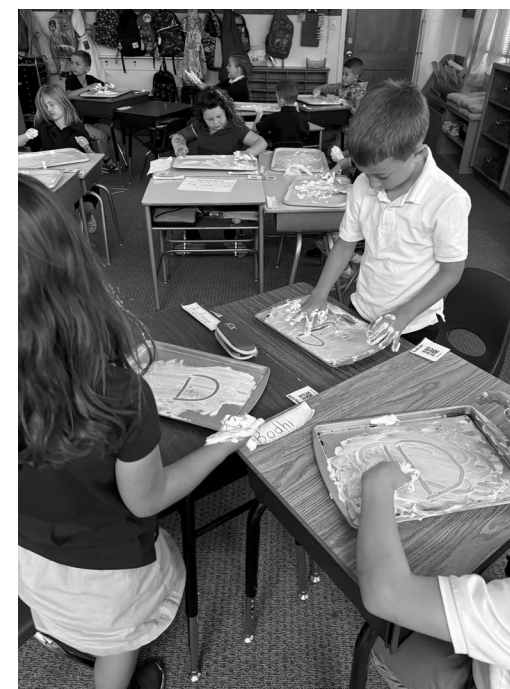
1st grade practicing their letter formation.