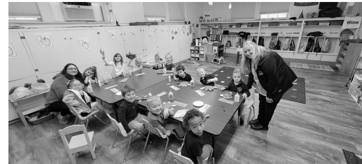
Turkey creations in preschool today

Our Mission: Serving as disciples, nourished by Christ, growing in faith, values, and overall excellence. We are Holy Family Catholic School