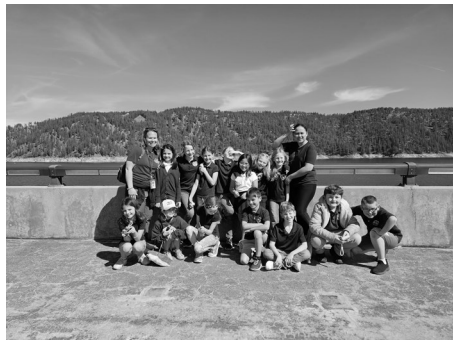
3rd graders visited Dworshak Reservoir and Fish Hatchery this week

Donations: All donations can be made on our website under "donate": <a href="www.holyfamilyclarkston.com">www.holyfamilyclarkston.com</a>, or you can send a check to the school office. Check out all the ways you can help online. You can select the category you would like your funds to go. We appreciate your generosity!