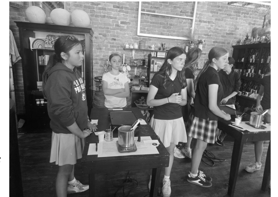
Middle School at Tin Can Co. making candles for their Auction Basket.